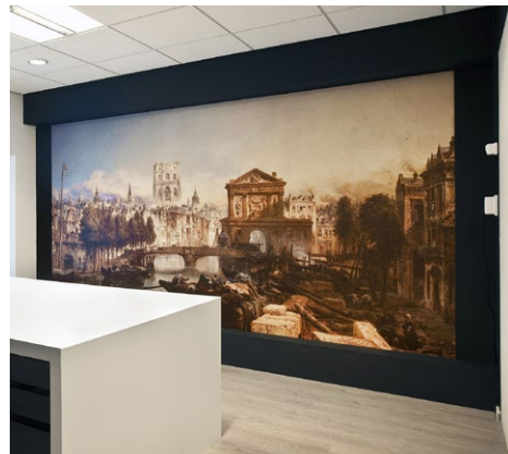
MPI 2611 Wall Film